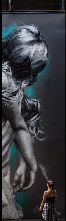
JUDITH DE LEEuw